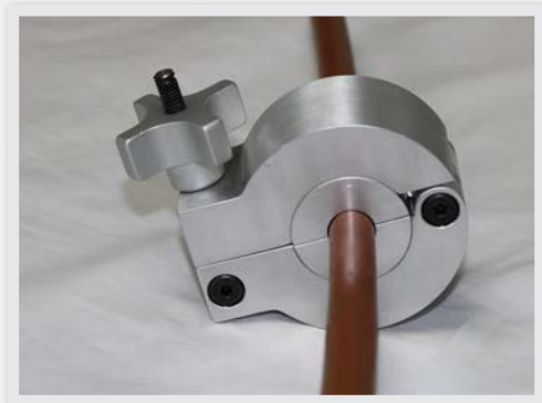
Reusable Microduct Coupler