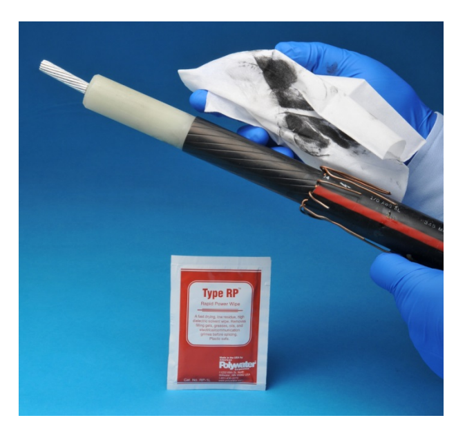
Type RP<sup>™</sup> Rapid Power is fast evaporating and effective