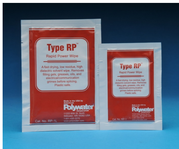
Convenient pre-saturated towelettes (RP-1L, RP-1) control solvent exposure.

Each PEL-PAC® package utilizes non-linting, non-tearing towels. Clean wipes are always available, eliminating recontamination of parts with dirty rags.