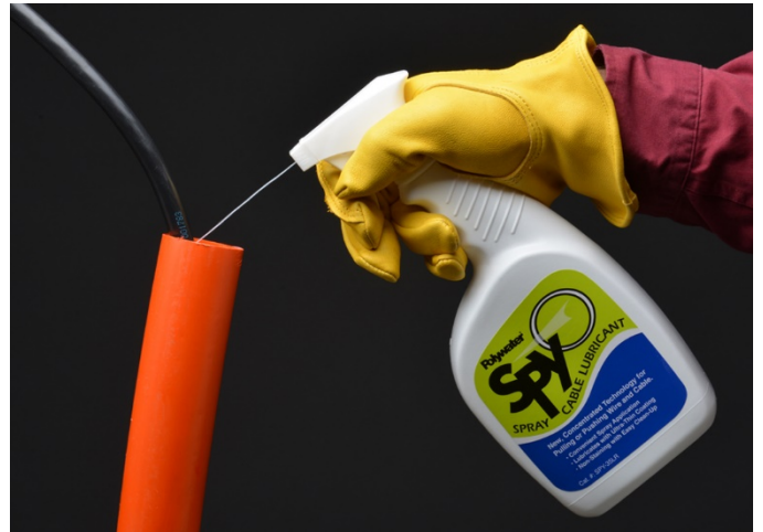
Polywater SPY can be sprayed directly into ducts or onto cables

Polywater SPY is recommended for spray or wipe lubrication with no mess. The lubricant is suitable for all types of cable installations.