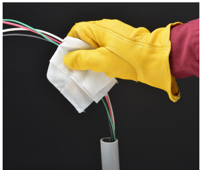
Wipe application with Polywater SPY-D20

Polywater SPY wipe package (SPY-D20) is a convenient way to apply lubricant for shorter cable runs. Each wipe coats and lubricates 50 to 100 feet (15 to 30 meters) of cable. Use additional wipes as needed for longer, larger, or more difficult pulls. A light coating of Polywater SPY facilitates cable pushing or pulling.