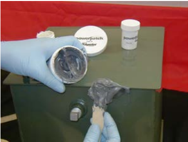
Apply PowerPatch® Sealant over putty patch or leak area