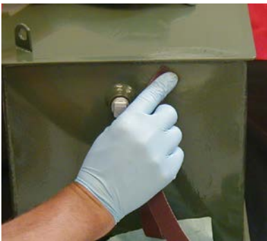
Sand or brush repair area