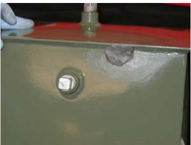
Apply putty ½ inch beyond leak; ⅛ to ¼ inch thick