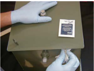
Clean area with cleaning wipe before applying PowerPatch® Putty