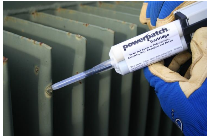
The PowerPatch® Leak Repair System provides a fast and easy in-field leak repair system.

PowerPatch® Sealant shows good adhesion and no leakage under high pressure with both air and polybutene oil.