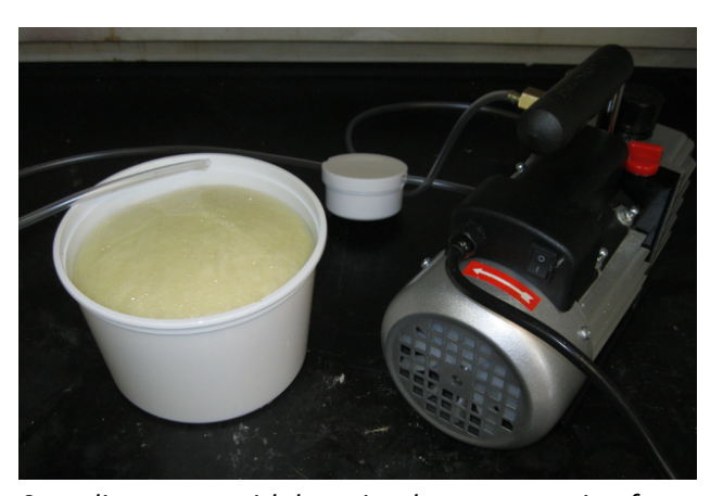
Sampling pump with hose intake near reacting foam

A filter sampling method provided by ALS Environmental, an accredited laboratory was used to collect test specimens. This is a common method of collecting aerosol (particulate) and/or vapor phase contaminants. Filter sampling uses a calibrated personal sampling pump to pull a known volume of air through a filter cassette. The filter cassette contains media chemically treated such that the MDI in the air chemically reacts with the media to form a stable derivative. The stable derivative is quantified at the ALS lab. Using the known volume of air sampled, the concentration of MDI in the air during the sampling interval is determined. This test procedure follows OSHA 47 MOD for MDI.