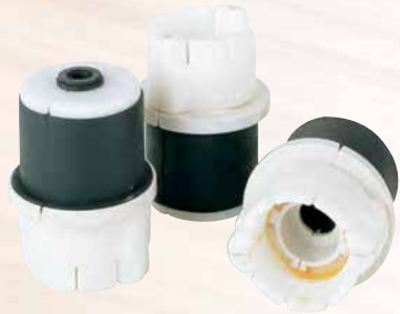
U.S. Patent No. 4,842,364.