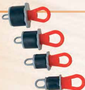
Taper of Universal Plugs