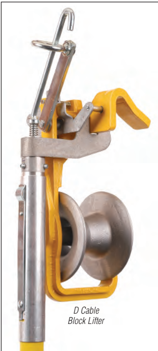
D Cable Block Lifter