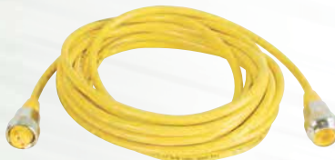
Chart Recorder & Cord Replacement Parts for Old Style ECB