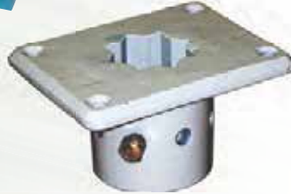
Floor Socket Mount