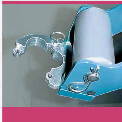
Adapters Split for Easy Removal