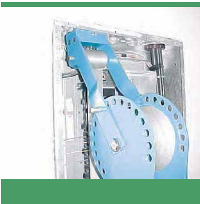
Can be used for Vertical or Horizontal Pulls