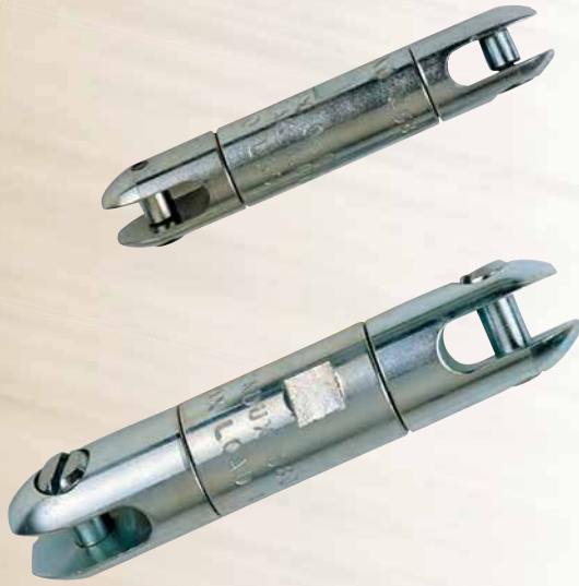
U. S. Patent No. 4,687,365.